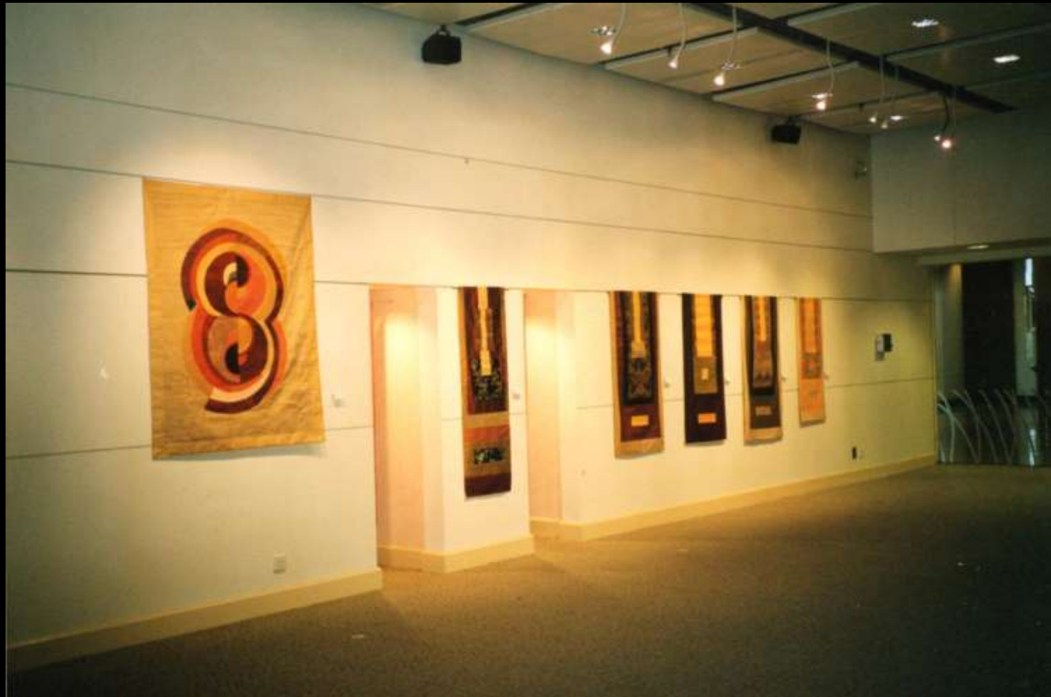
Expo 2007, Goethe Institut, Kuala Lumpur Malaysia