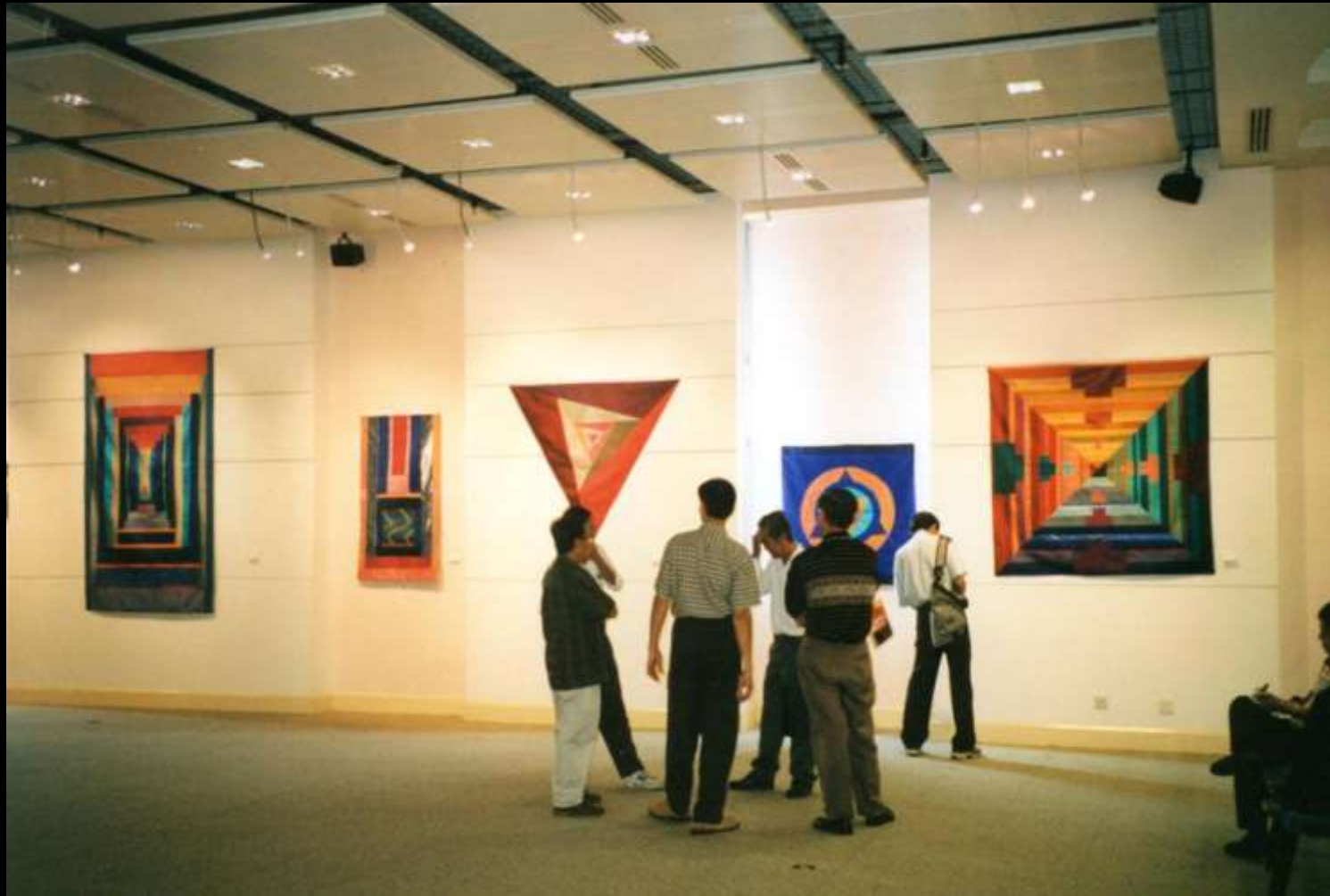
Expo 2007, Goethe Institut, Kuala Lumpur Malaysia